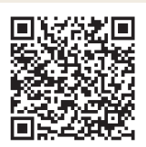
Loop Course From/to Experience Plaza

Even in the mountains offline on your mobile you can be checked on the YAMAP.