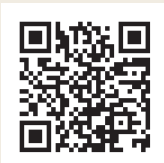
Course C From Roadside station to Experience Plaza